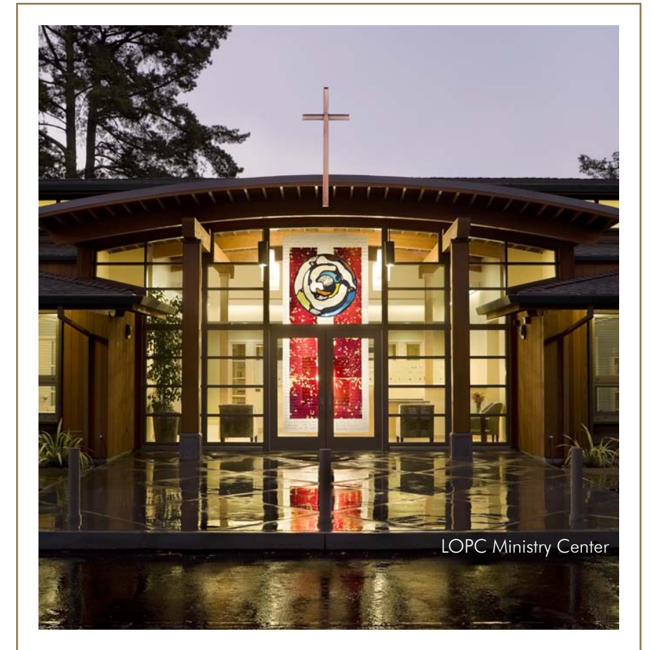
LOPC Ministry Center

LAFAYETTE-ORINDA PRESBYTERIAN CHURCH 49 Knox Drive | Lafayette CA 94549 | www.LOPC.org