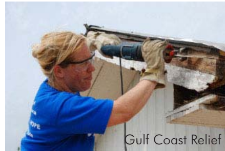
Gulf Coast Relief

LOPC is a vibrant, thriving and caring congregation that is bringing hope and renewal locally, nationally and globally through the grace and love of Jesus Christ.