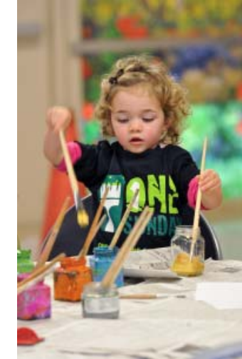
One Sunday Mission Project