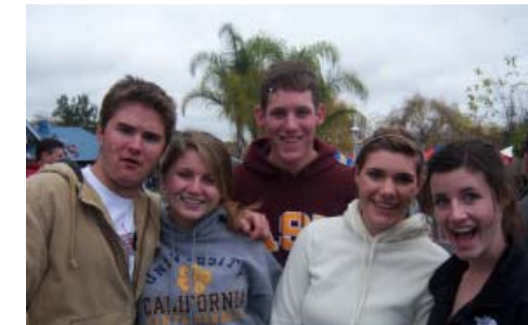
High School Youth Group