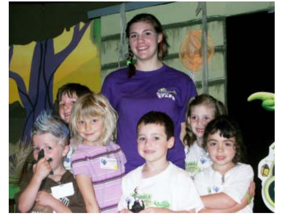
Vacation Bible School Camp